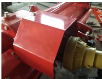
Metal Gearbox Shield