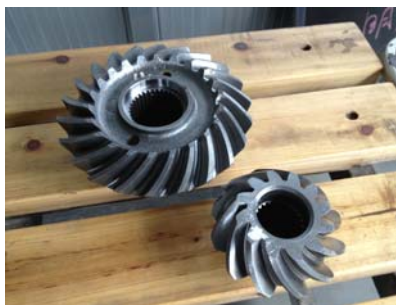
Spiral Gears for the top gearbox