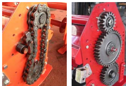
Side Chain Drive or Gear Drive

2207 Vista Chaparral Carlsbad, CA 92009, USA Tel: 001 760 6210018 Fax: 001 760 4544549 bill.yuan@autotechgear.com