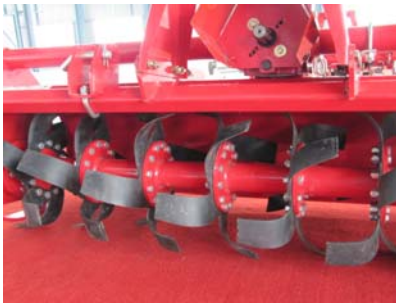
Rotor with 6 blades per Flange