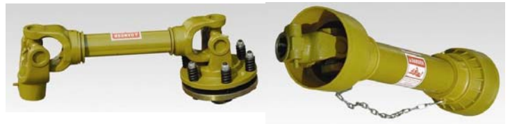
PTO shaft with Slip Clutch