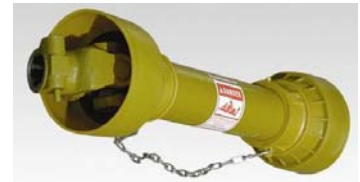
PTO shaft with Slip Clutch