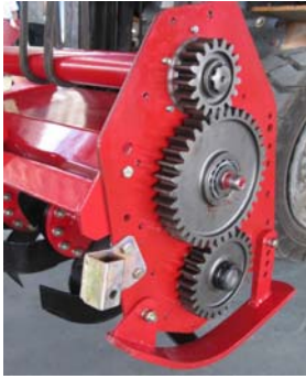
Side Gear Drive or Chain

2207 Vista Chaparral Carlsbad, CA 92009, USA Tel: 001 760 6210018 Fax: 001 760 4544549 bill.yuan@autotechgear.com