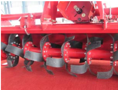
Rotor with 6 blades per Flange