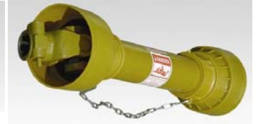
PTO shaft with Slip Clutch