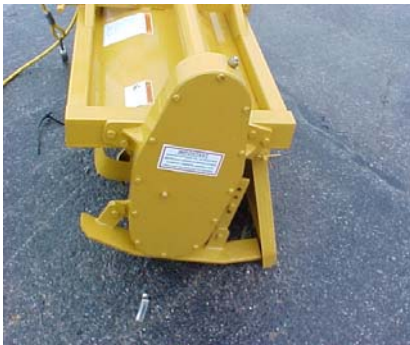
Side Gear Drive with Heavy Duty Cast iron case and cover