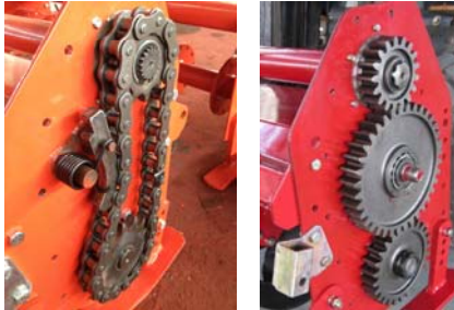
Heavy Duty 16A Side Chain Drive or Gear Drive