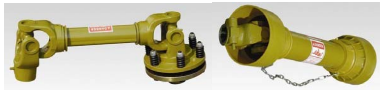
PTO shaft with Slip Clutch